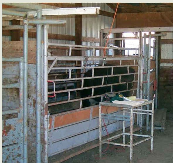
Original scale and chute design in the CREC north barn installed in 1972. Cattle entered from the north into a single alley with one animal space ahead of the scale. Animals exited through the south door after passing through the squeeze chute where processing procedures were done. The straight-in design in a poorly lit environment made loading the chute difficult, and the loud, clanging chute caused cattle to balk.

Livestock handling philosophies and techniques have changed through time. The photo below illustrates classic design flaws in livestock-handling facilities. In this system, cattle are forced through a small door into a darkened barn from an outside alley/holding pen. Concurrent with entering the barn, the animals must push through spring-loaded backstops protruding from the side of the alleyway.