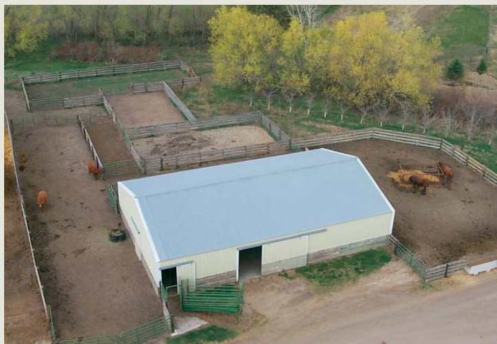
Overhead view of the north barn with outside holding pens, alleys and loading chute on the south side. Barn dimensions are 64 feet by 40 feet.