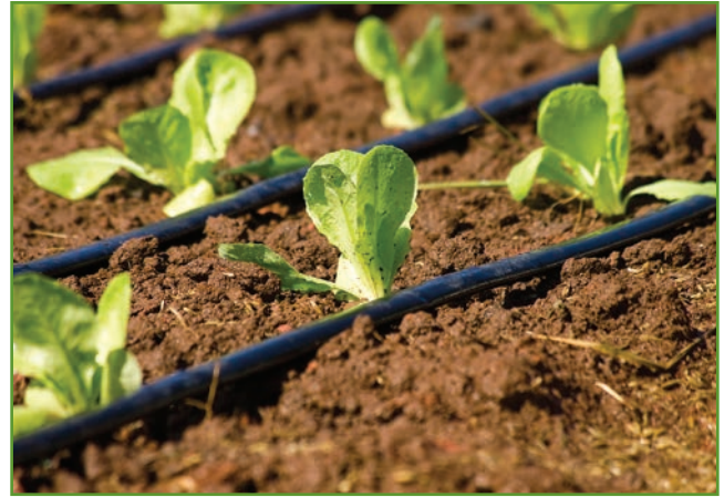
Figure 2. Drip irrigation is a very efficient way to irrigate your garden.

Crop evapotranspiration ( ET_0 ) is the amount of water lost from the soil to evaporation and transpiration, which is the water that travels from the soil through