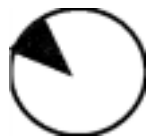
round, bundt, tube