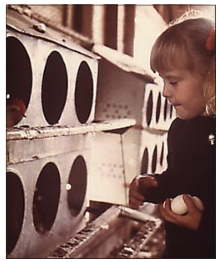
Typical nests for the small laying flock.