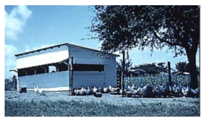
A conventional poultry house for a small flock of pullets or laying hens.

Small laying flocks are generally floor housed or allowed to range rather than kept in cages. Fly control can be a problem where layers are caged. Housing requirements for floor and free-range layers are simple and easy to arrange on most small family farms. Provide hens with 3 square feet of floor space per bird. Protect them from adverse weather conditions and predators. The structure must also protect feeders and be suitable for nests and a roost. Tube feeders and an automatic waterer are recommended for floor layers.