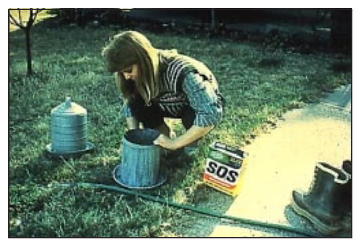
Good health is dependent on clean, potable water.

Clean, potable water and feed must always be available. Add poultry vitamins, at the recommended level, to the drinking water the first week to ensure that birds have sufficient vitamins and to prevent leg problems.