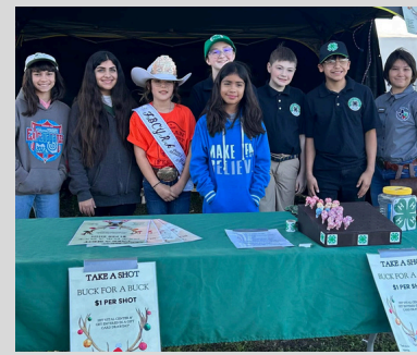
4-H Ambassadors at the Pecan Harvest Festival

Fort Bend County 4-H Youth Ambassadors are actively learning leadership & community service . The group hosted a pet food drive on October 12 at Tractor Supply. They also hosted a fun activity and fundraiser during the Pecan Harvest Festival with a "Buck for a Buck" where people could donate money and practice archery on Nov 23. The group meets monthly to learn skills and make plans to serve.