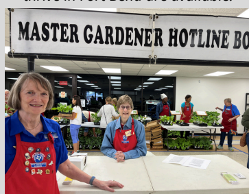
Answers are available on-the-spot. The hotline is also available all year.