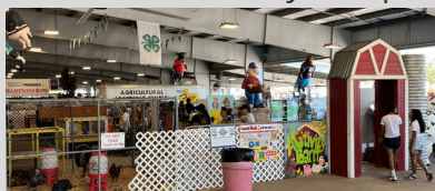
Welcome to the AG'tivity Barn!

The AG'tivity Barn has been promoting agriculture awareness for more than 20 years. In conjunction with the Fort Bend County Fair and with support from Fort Bend County Farm Bureau , Fort Bend County Extension hosted the annual event Sep 27- Oct 6, 2024. AG'tivity Barn is a hands-on, interactive way to bring agriculture to life. With six learning stations during school tours, and various agriculture themes on nights and weekends, fairgoers are exposed to a variety of topics. Because everyone in the Fort Bend County Extension office is involved in the Fair in one way or many, the in-kind contributions are considered a "Cornerstone Sponsorship" of the Fort Bend County Fair. In 2024, an estimated 105,000 people attended the Fair. A percentage, around 63,000 fairgoers participated in the public interface of the AG'tivity Barn during open Fair hours. During organized school tours, 1,214 participated (1,119 students, 95 adults) from 10 Fort Bend County Schools . Friday was reserved for special tours for participants in the Exceptional Rodeo when about 150 people came through to see and touch the exhibits.