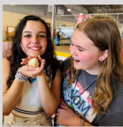
Students from PEAK Academy petting precious poultry