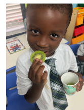
A cutie with a kiwi