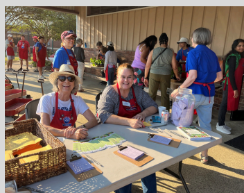
Helpful volunteers are ready to complete the sale.

The Master Gardener's hosted the fall Vegetable and Herb Plant Sale on Oct 12 in the Extension Education Center. A variety of 3,000 starter plants were cultivated in the MG Greenhouse; 1,000 went to non-profit organizations and the other 2,000 were sold at the plant sale, with gross sales totaling $5,466 to help fund future 501(c)3 programming efforts. Around 80 volunteers worked the event and 137 shoppers attended.