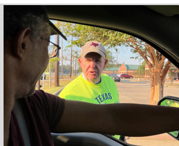
A friendly face welcomes plant sale visitors.

The Fort Bend Master Gardener Association's Vegetable Team activity serves the community in a variety of ways, not the least of which is their food drive and fresh produce contributions to the Mamie George Community Center and Trini's Market Food Pantry. Led by Jean Trevino, the group harvests produce from the teaching gardens at the Extension office to donate. On Nov 20 they delivered 44 lbs. of fresh vegetables . Customers at the market can shop for their choice of fresh food items.