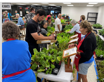
A wide selection of plants known to thrive in Fort Bend are available.

The Master Gardener's hosted the fall Vegetable and Herb Plant Sale on Oct 12 in the Extension Education Center. A variety of 3,000 starter plants were cultivated in the MG Greenhouse; 1,000 went to non-profit organizations and the other 2,000 were sold at the plant sale, with gross sales totaling $5,466 to help fund future 501(c)3 programming efforts. Around 80 volunteers worked the event and 137 shoppers attended.