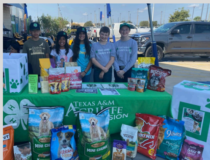
4-H Ambassadors collecting for the pet food drive

Fort Bend County 4-H Youth Ambassadors are actively learning leadership & community service . The group hosted a pet food drive on October 12 at Tractor Supply. They also hosted a fun activity and fundraiser during the Pecan Harvest Festival with a "Buck for a Buck" where people could donate money and practice archery on Nov 23. The group meets monthly to learn skills and make plans to serve.