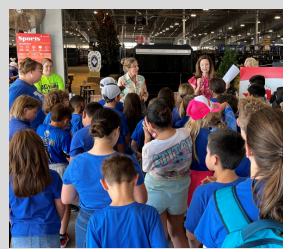
The Costal Cattlewomen help teach students from Needville Schools