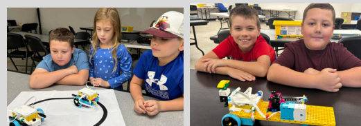
Participants in the STEM/Robotics Homeschool Labs learned to build, code, and test robots to perform specific tasks.