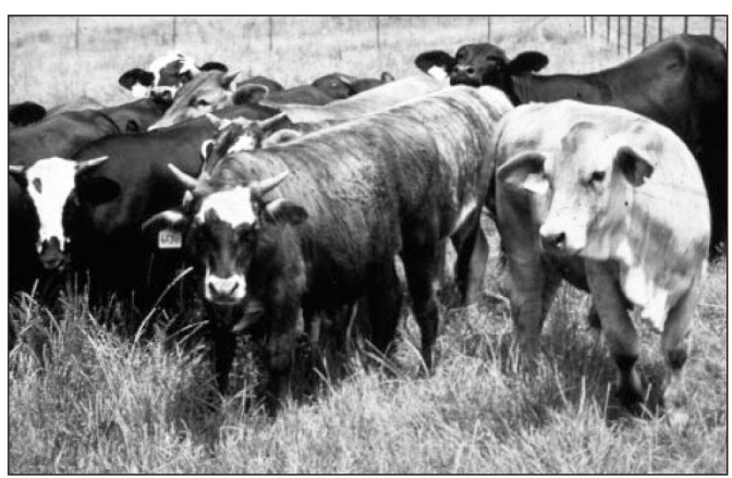
Preconditioned weanlings are destined to be stockers, feeders and replacements.

This calf preconditioning immunization concept for beef herds provides protection against infectious diseases through passive and active acquired immunity for unborn, nursing and weanling calves. It involves giving immunizations before and after the calves are born. The immunizations for the vaccination schedules for a beef herd should be determined by a veterinar-