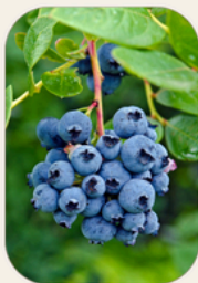
BLUEBERRIES January 23

LEARN HOW TO GROW, PREPARE, COOK AND PRESERVE THE FRUIT/VEGETABLE