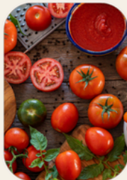
TOMATOES February 6