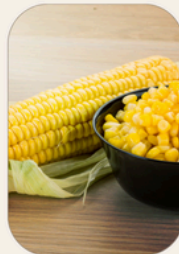
SWEET CORN April 17