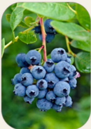
BLUEBERRIES January 23

LEARN HOW TO GROW, PREPARE, COOK AND PRESERVE THE FRUIT/VEGETABLE