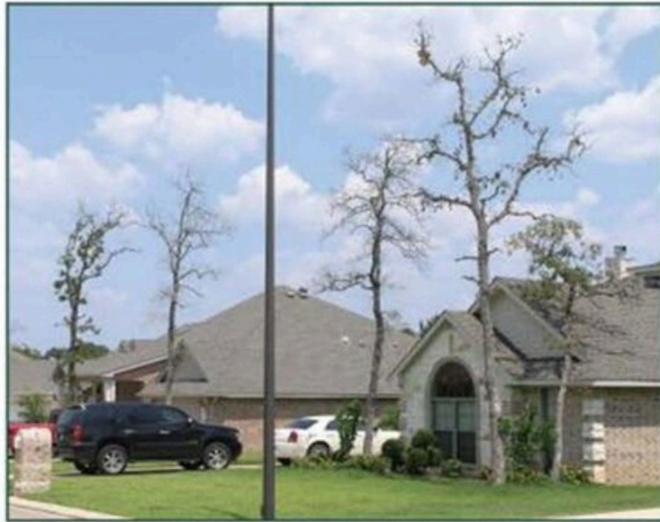
Figure 2. Declining trees at high risk of Hypoxylon canker.