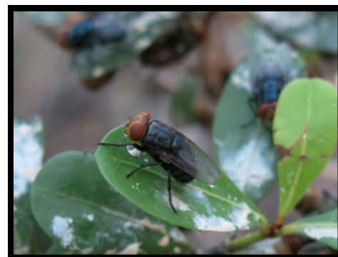
Adult New World Screwworm Fly