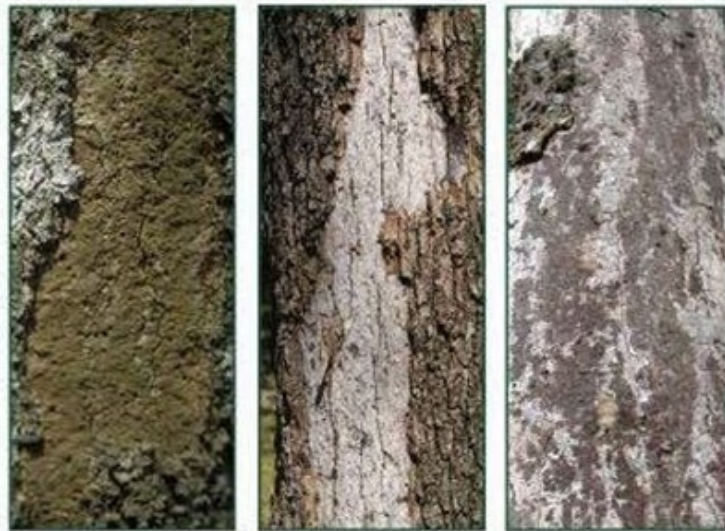
Figure 4. Stages of Hypoxylon canker: early stages (a), later stages (b), advanced stages (c). Sources: David N. Appel, Sheila McBride

Once Hypoxylon canker is evident, it is usually too late to try to save the tree. Large portions of the tree will be dead, reducing its desirability as a landscape specimen. The structural integrity of the wood is also compromised, and the tree becomes a hazard. Carefully inspect and consider removing trees with symptoms of Hypoxylon canker.