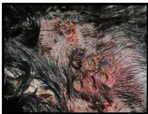
Screwworm Infestation in Dog

The Texas A&M AgriLife Extension factsheet can be found at: Screwworm Factsheet