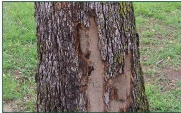
Figure 3. The disease causes bark to pop or fall off, revealing the fungal mat underneath.

As these symptoms progress, the outer bark falls from the tree to expose the fungus, Biscogniauxia (Hypoxylon) atropunctatum , that causes the disease (Fig. 3).